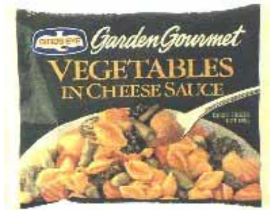
Birds Eye Garden Gourmet vegetables