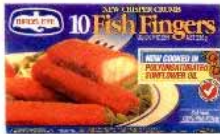
Birds Eye Fish Fingers