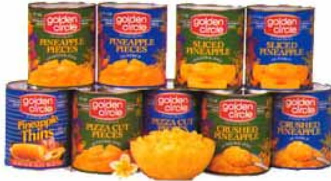
Golden Circle products