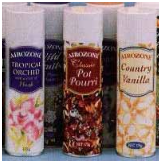
Airozone Air Freshener aerosol spray Product code RC00452