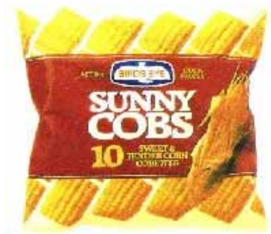
Birds Eye Sunny Cobs