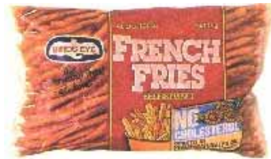
Birds Eye French Fries