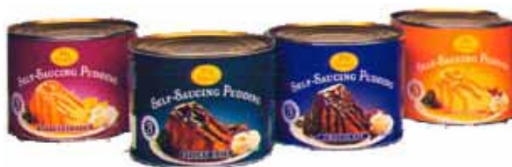
Big Sister self saucing puddings