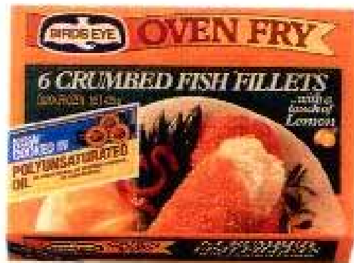
Birds Eye Fish Fillets