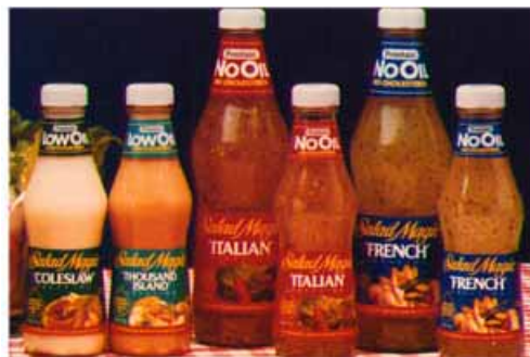
Salad Magic products