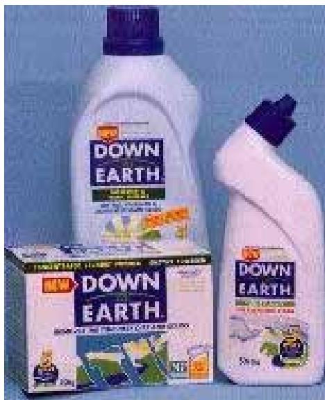
Down To Earth products