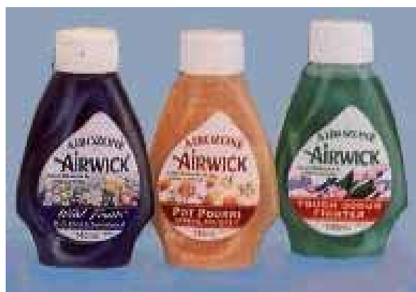
Airozone Room Deodoriser Airwick - tough odour fighter Product code RC00038